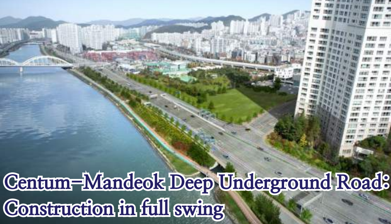
Centum-Mandeok Deep Underground Road: Construction in full swing

The KTX Ieum is to stop at Sinhaeundae Station. It will enable Dongbusan passengers to travel to the metropolitan area quickly and promote tourism and economic revitalization in the Haeundae area. The operating routes are the Donghae Line (Bujeon-Haeundae-Ulsan-Pohang-Donghae-Gangneung) and the Jungang Line (Bujeon-Haeundae-Singyeongju-Yeongcheon-Wonju-Cheongnyangni) and it is scheduled to open in the second half of 2022.