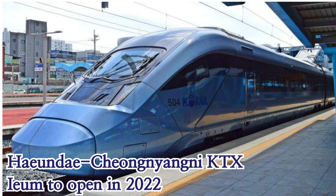
Haeundae-Cheongnyangni KTX Ieum to open in 2022

Jwadong New Town will be renamed Haeundae Green City and transformed into a smart city through apartment remodeling. Haeundae plans to prepare for future-oriented and sustainable urban development centered on residents by conducting research services for the development of Jwadong. In addition, in June 2021 an ordinance promoting the remodeling of old apartment houses will be enacted to provide systematic and practical support for the remodeling process.