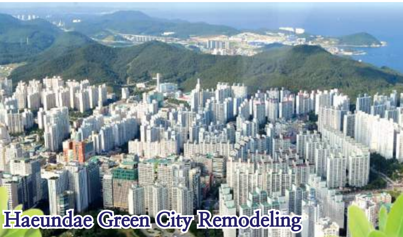
Haeundae Green City Remodeling

In 2019, Haeundae independently promoted the Osiria Line extension of Metro Line 2, and Busan City also reflected this in this year's 'Busan Metro Network Construction Reorganization Plan'. When Metro Line 2 is extended to Osiria, traffic congestion will be resolved, accessibility to the city center improved and local tourism is also expected to be revitalized.