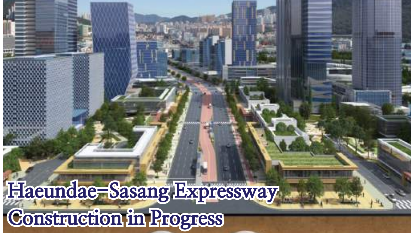
Haeundae-Sasang Expressway Construction in Progress

If a deep underground road connecting the East and West areas of Busan regions is built, it will be helpful in resolving the regular traffic jams on existing roads. The 9.62km-long underground road will be built on a four-lane round-trip between Jaesong-dong and Mandeok-dong, Buk-gu, and construction work is currently in full swing with the goal of opening in November 2024.